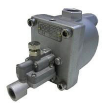
Smart Guard POD